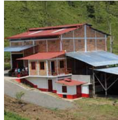
Central Mill in Jardín, Colombia