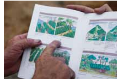
Training program for farmers based on the TASQ™