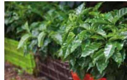
Plantlets, Caldas, Colombia