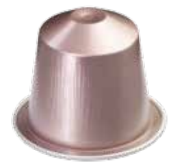
Rosabaya : the first 100% AAA sourced Nespresso Pure Origin Grand Cru