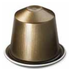
Dhjana : the first 100% AAA sourced Limited Edition Nespresso Grand Cru