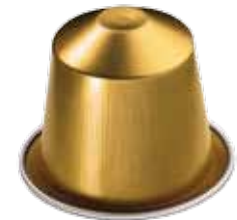
Volluto : the first 100% AAA sourced Nespresso Grand Cru