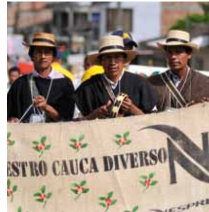
Celebration in Popayán